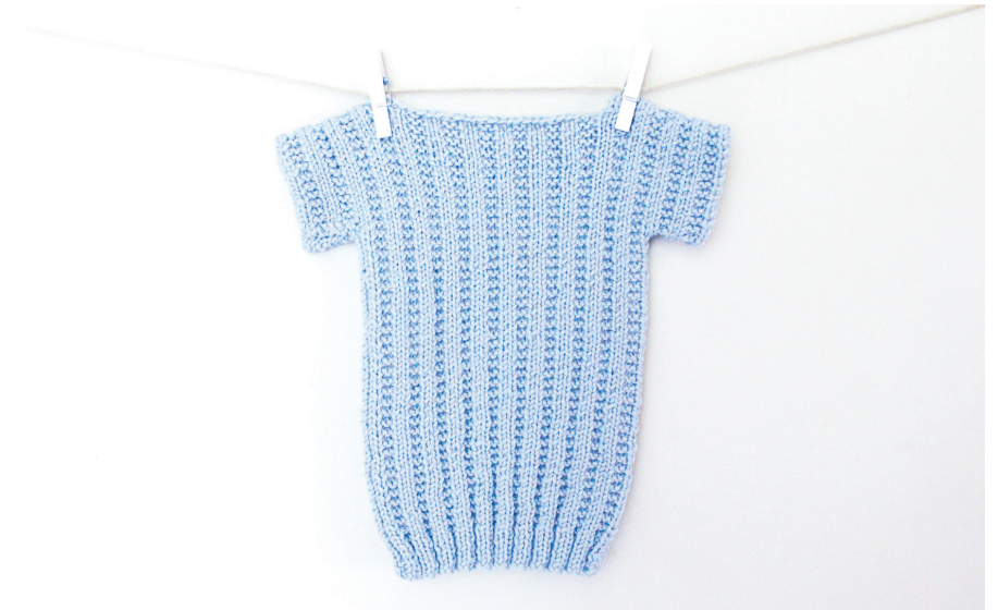
This pattern was designed and written by Natalie Simpson.

(There is no need to crochet around the neck edge as this often makes it too tight)