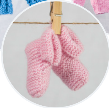
Garter stitch booties 3 ply