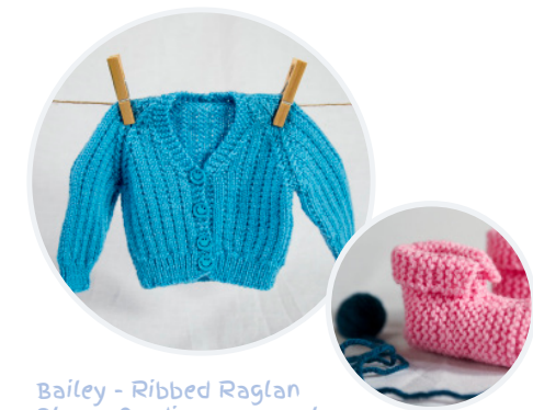
Bailey - Ribbed Raglan Sleeve Cardigan 3 or 4 ply