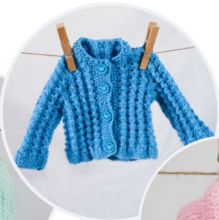
John 4 ply