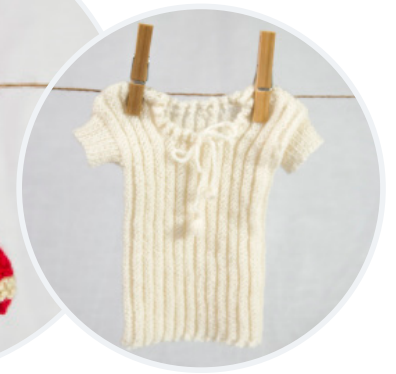
Ribbed singlet 2 ply