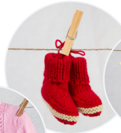
Contrast striped booties 4 ply