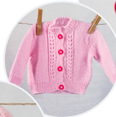
Grace 4 ply